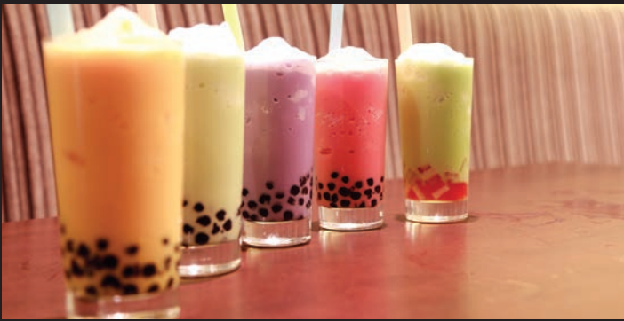
D3. Bubble Teas