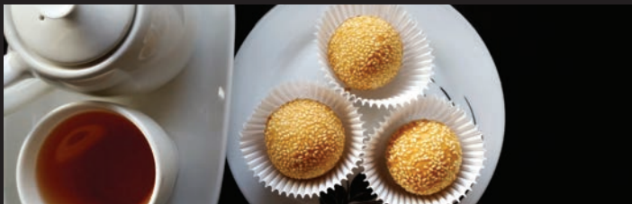
T2. Fried Green Bean Cake