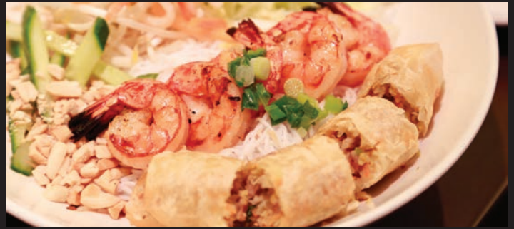
B2. Grilled Shrimp Vermicelli