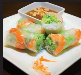
A2. Shrimp Fresh Rolls