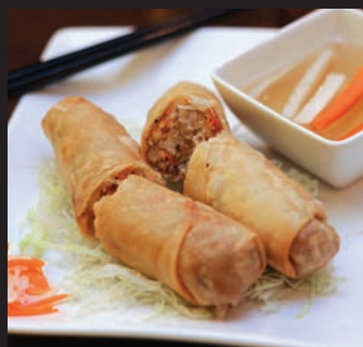
A1. Spring Rolls